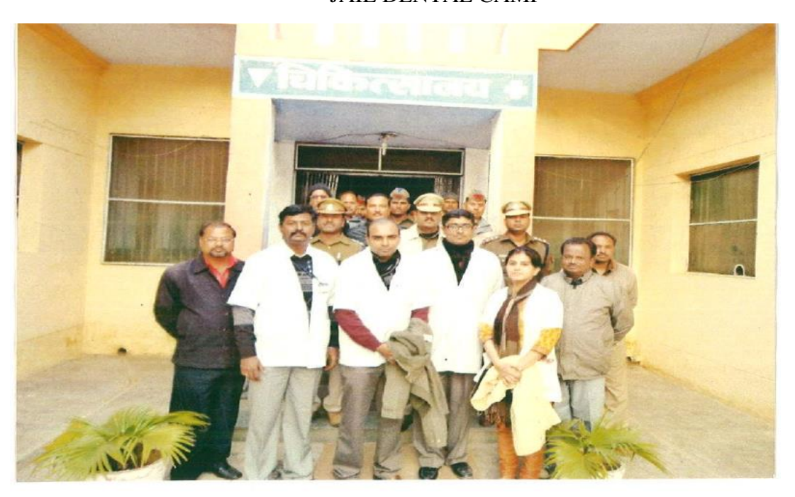
JAIL DENTAL CAMP HELD AT BULANDSHAHR JAIL ON 24th DECEMBER 2015