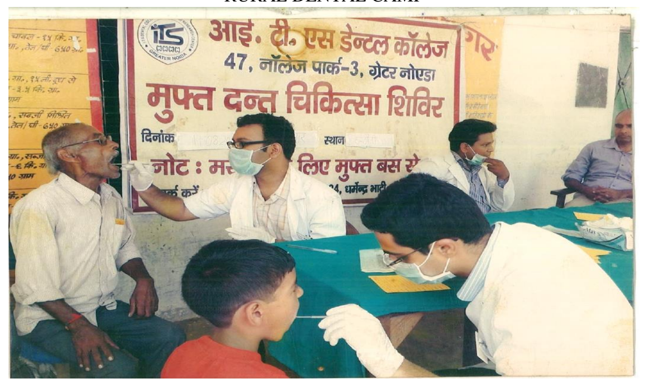
RURAL DENTAL CAMP AT MUNJKHERA DANKAUR, GREATER NOIDA ON 9<sup>th</sup> AUGUST 2014