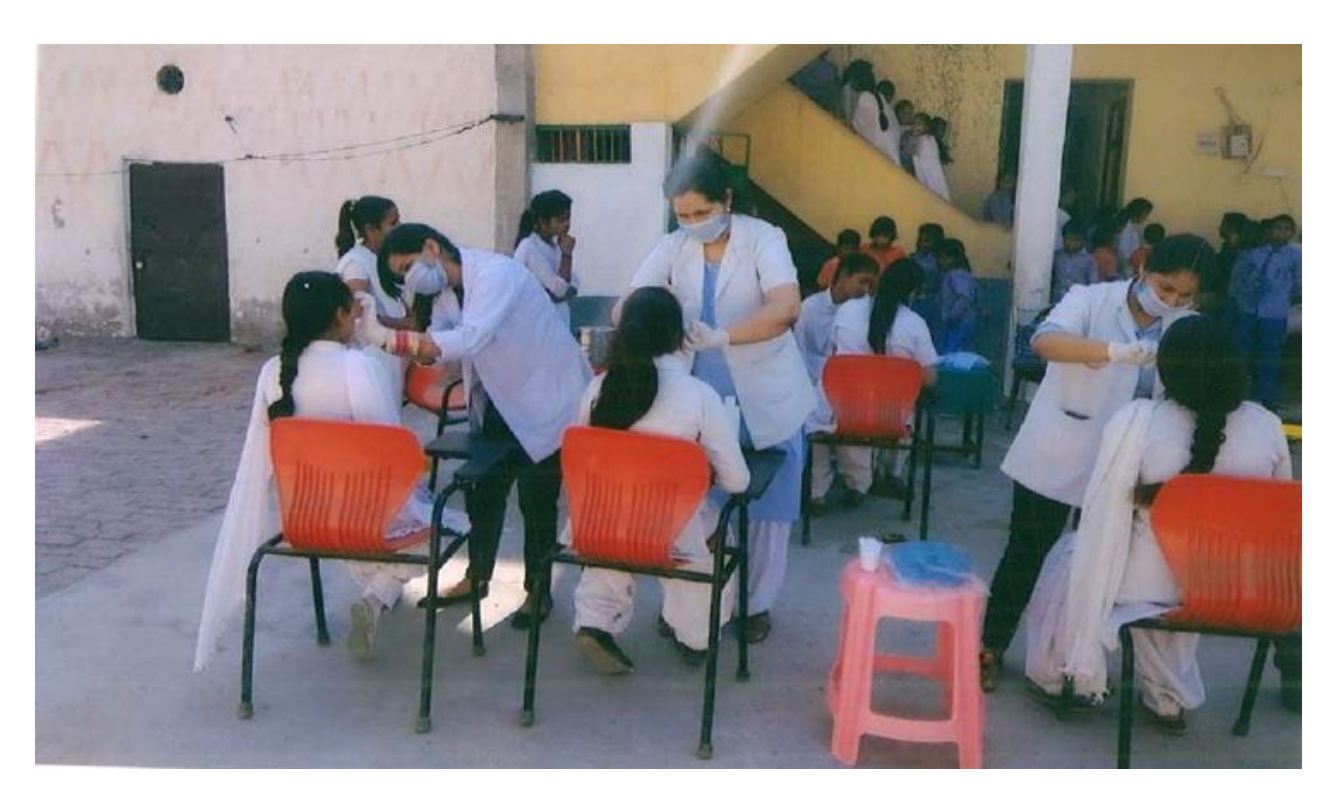
TAKING IMPRESSION OF THE STUDENTS FOR STUDY CAST AT DADHA SCHOOL ON 16^{\rm TH} APRIL 2016