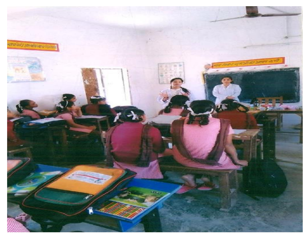
TEACHING CHILDREN ABOUT MAINTAINING GOOD ORAL HYGIENE AT SIDDHI VINAYAK PUBLIC SCHOOL ON 15^{\mathrm{TH}} MAY 2019