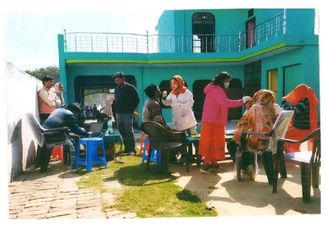
PATIENT GETTING THEIR CHECK UP DONE IN RURAL DENTAL CAMP HELD AT DADRI ON 2^{\rm nd} FEBRUARY 2019