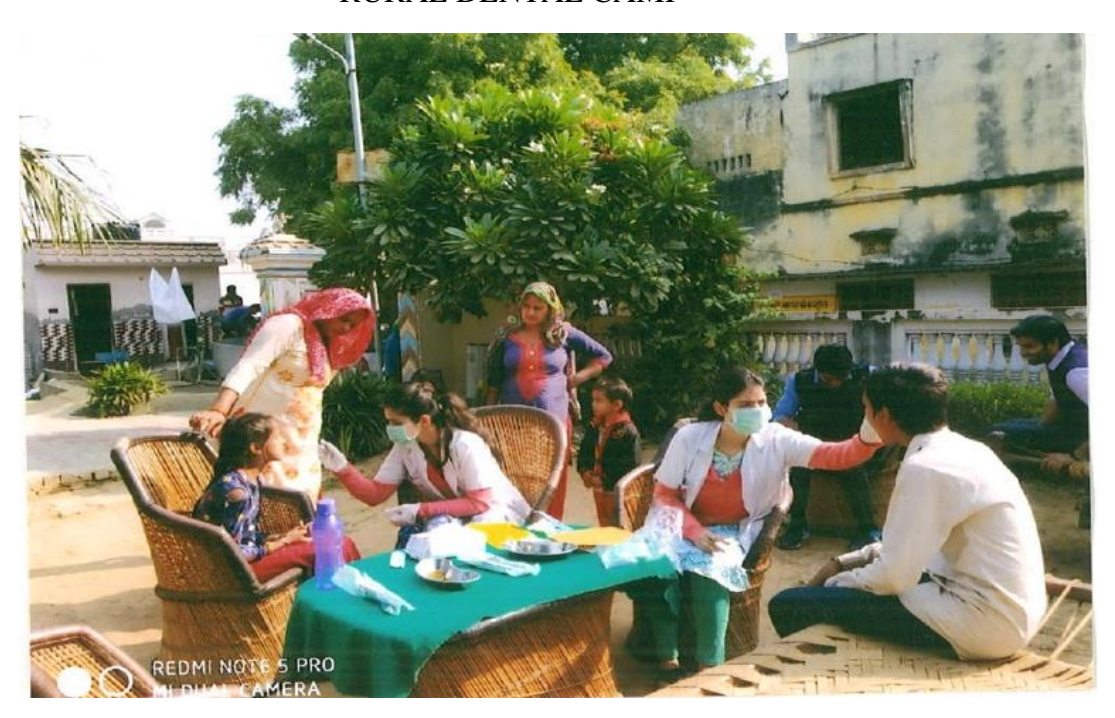
RURAL DENTAL CAMP HELD AT KHEDI ON 3<sup>rd</sup> NOVEMBER 2018