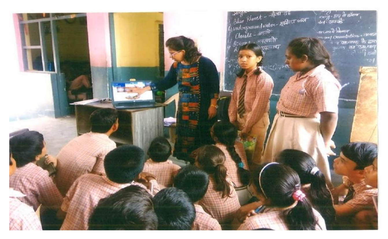
EDUCATING CHILDREN ABOUT ORAL HYGIENE THROUGH PRESENTATION AT GHORI SCHOOL PN 6^{\mathrm{TH}} MAY 2017