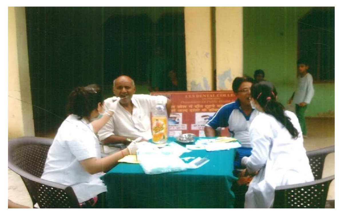
POST GRADUATE STUDENT EDUCATING PATIENT AND HIS FAMILY ABOUT TOBACOO CESSATION AT DELTA-1 ON 1^{\rm ST} JULY 2018

SOCIETY DENTAL CAMP HELD AT GAMMA -2 ON 9th MAY 2017