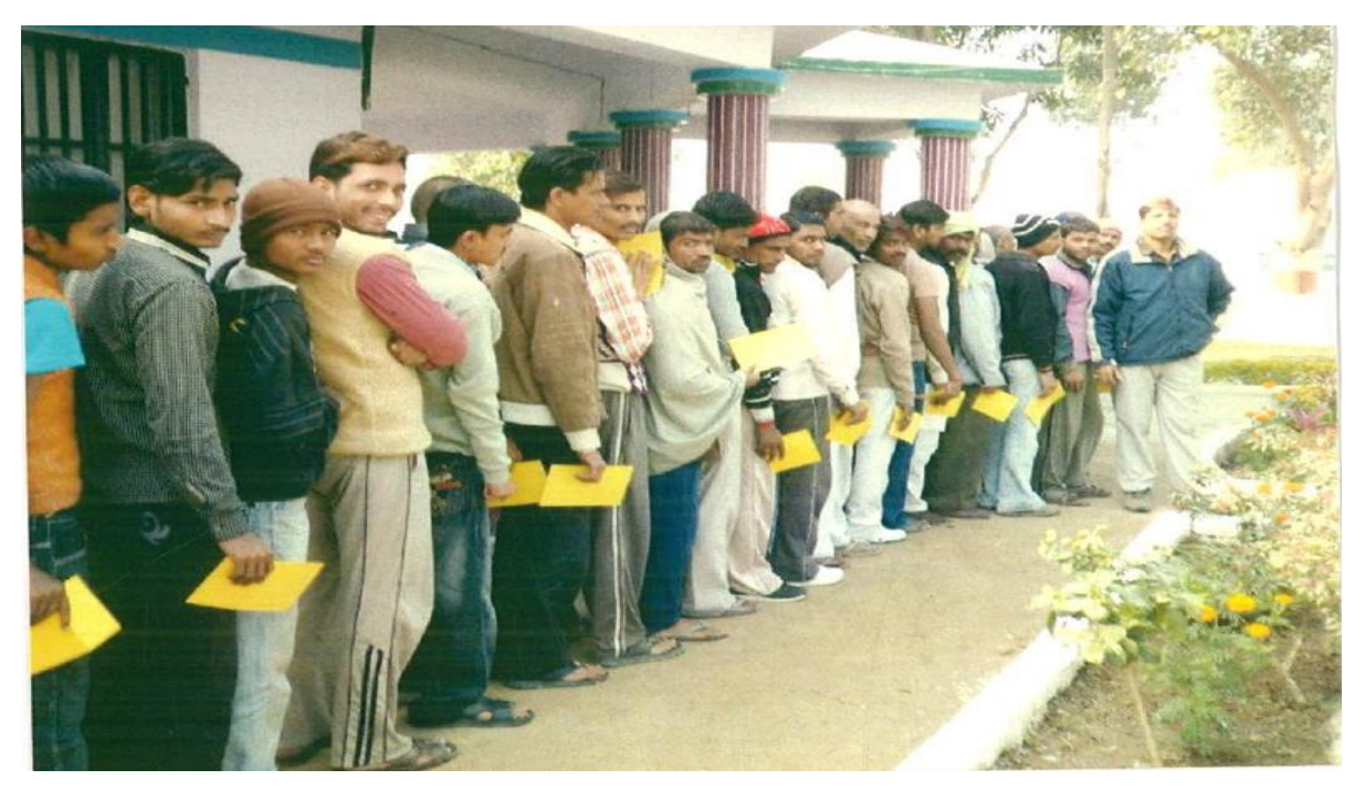
PATIENTS WAITING IN THE QUE FOR DENTAL CHECK UP AT BULANDSHAHR JAIL ON 19^{\rm th} JANUARY 2016