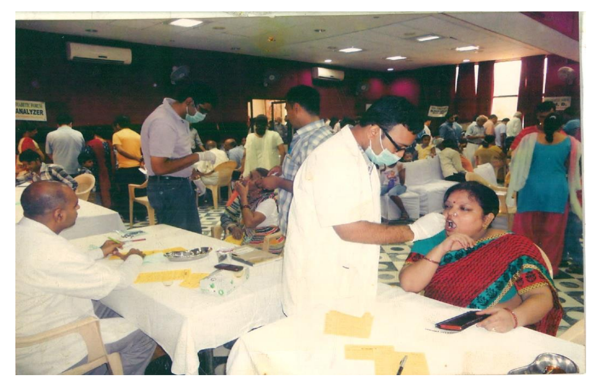
PATIENT GETTING THEIR CHECK UP DONE IN SOCIETY DENTAL CAMP HELD AT CHAAMRA SOCIETY ON 22<sup>nd</sup> JUNE 2014