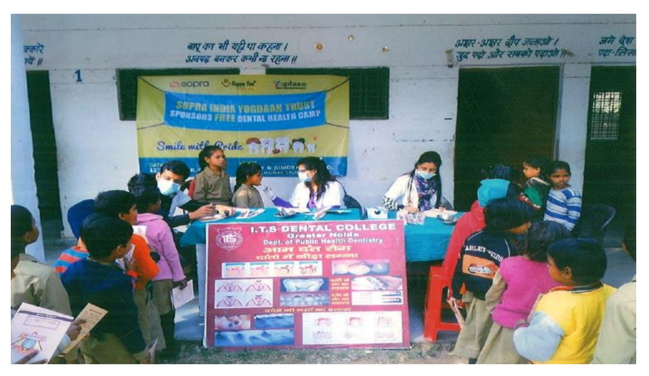
CHILDREN WAITING IN LINE FOR THEIR TURN AT VVN SCHOOL, DANKAUR ON 7^{\mathrm{TH}} OCTOBER 2016