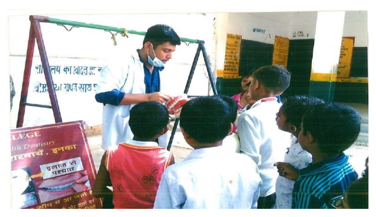
GIVING DEMO ABOUT BRUSHING TECHNIQUE TO THE CHILDREN AT CHAHULA SCHOOL ON 17^{\mathrm{TH}}\, MAY 2018