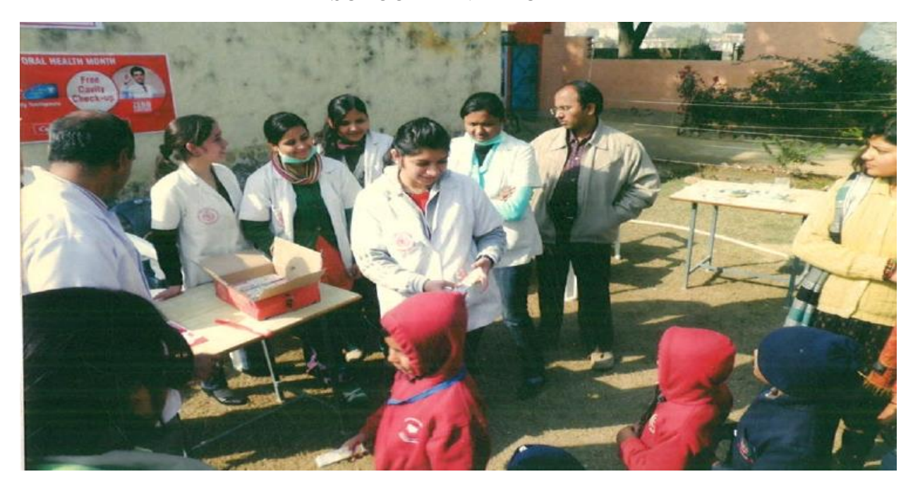
MOTIVATING CHILDREN IN KEEPING GOOD ORAL HYGIENE AT CAMBRIDGE SCHOOL ON 26^{\mathrm{TH}} FEBRUARY 2015