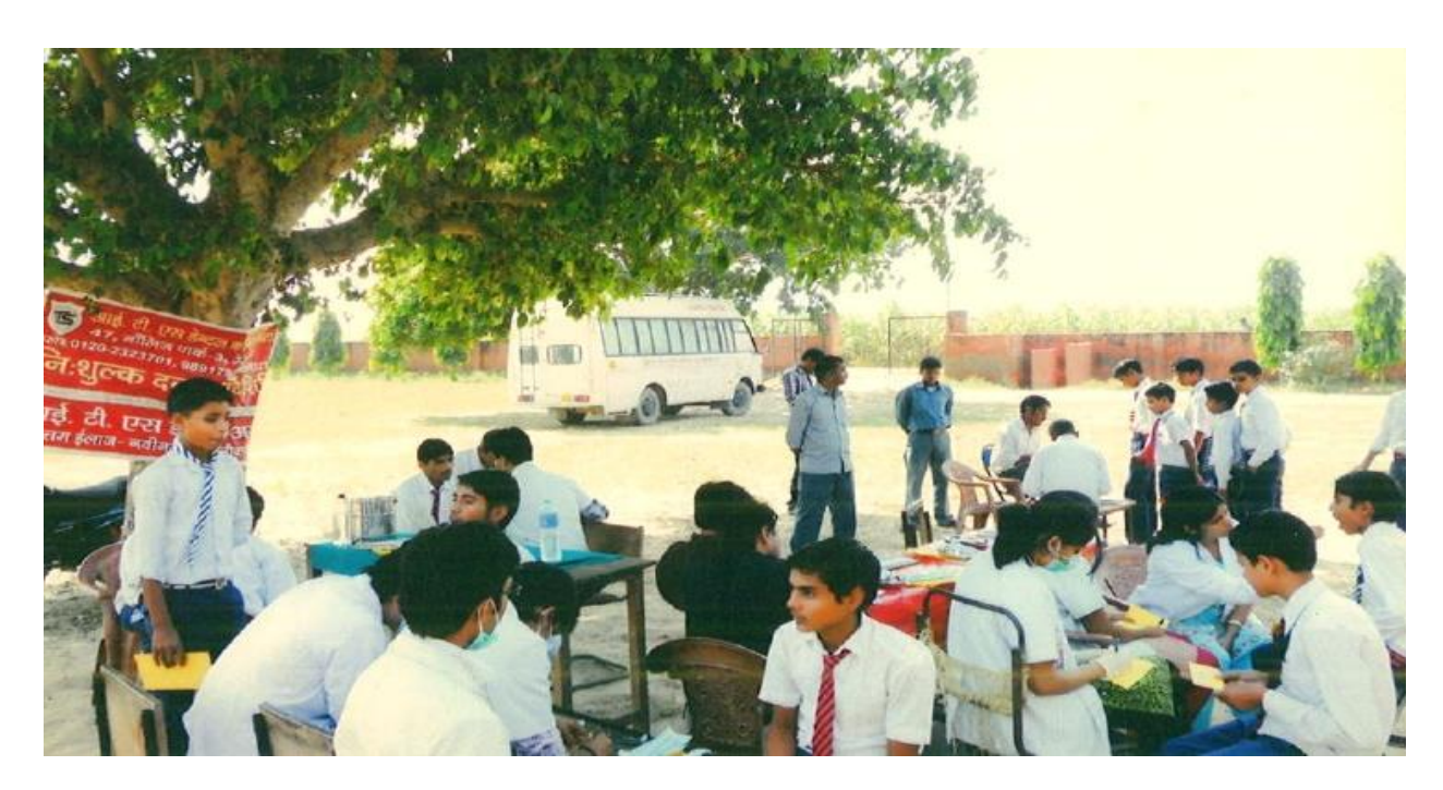
STUDENT MAKING CAMP CARDS AND WAITING FOR THEIR TURN IN SCHOOL DENTAL CAMP HELD AT CHALERA SCHOOL ON 30^{\mathrm{TH}} AUGUST 2014